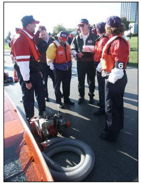
Above photo Zone 13 members

ISAR 2002 International Competitions Milwaukee, Wisconsin, USA October 9<sup>th</sup>, 2002 Team Maritimes